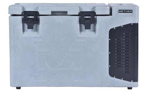
Can be used as refrigerator or freezer